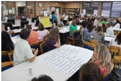
Teachers worked together in August to finalize plans.

Still, September 7, 2010 was unique among many first days because this year opens with especially great expectations. All of us are fortunate to be present to witness and participate in our school's growing energy. This is a great year to be part of Palm Beach Day and the first day was just the beginning of many exciting days ahead.