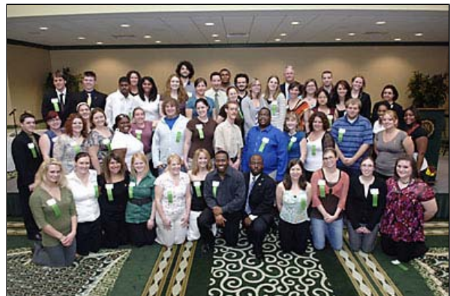
GOOD AS GOLD: Student Gold Medallion winners and nominees pose for a group shot after the Student Gold Medallion Awards March 27. Awards were presented in nine categories.